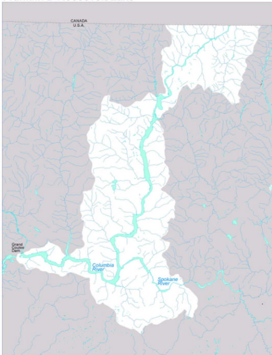
Figure 1. Lake Roosevelt watershed excluding the Sanpoil Basin, Spokane Basin, Kettle Basin, and Colville Basin